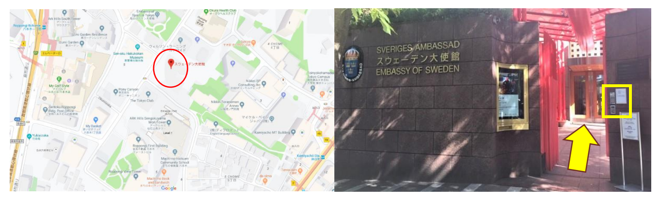
Map (Left), Main Gate of Embassy (Right)